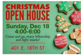
Portales Church of the Nazarene