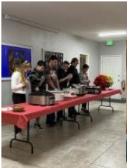
Las Cruces Church of the Nazarene-